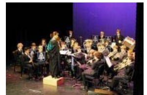
Many Musical Maestros

Another pleasing aspect of this year's applications, has been the increase in requests for music tuition support.