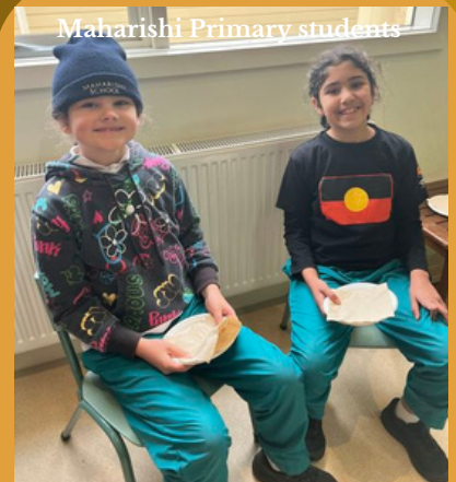
Maharishi Primary students