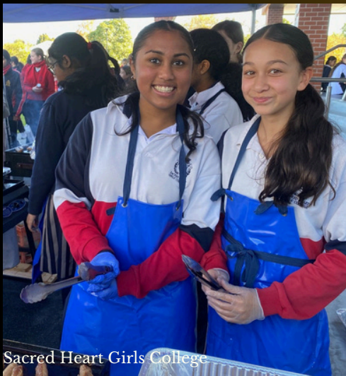
Sacred Heart Girls College