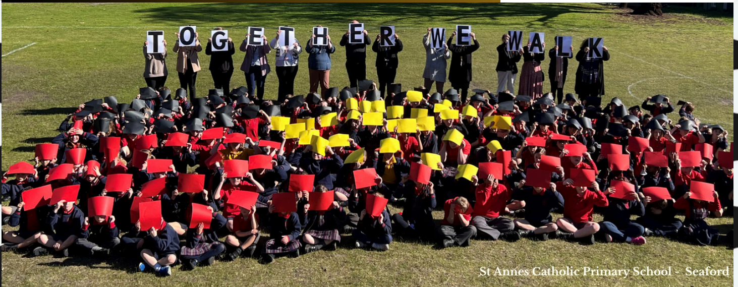
St Annes Catholic Primary School - Seaford

OPENING THE DOORS FOUNDATION Keeping Koorie Kids in an Education of their Choice