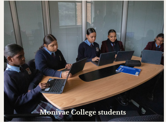
Monivae College students

Monivae College shared their appreciation of the support their students received from OTDF - "We would like to share a photo of our students who received your generous grants, which allowed them to purchase laptops for their studies at Monivae College. These laptops play a crucial role in their classwork and will be instrumental as they complete their end-of-semester tests. We are incredibly grateful to the foundation for this wonderful opportunity for our students. The laptops have been very well received and are making a significant difference in their learning experience. Thank you!"