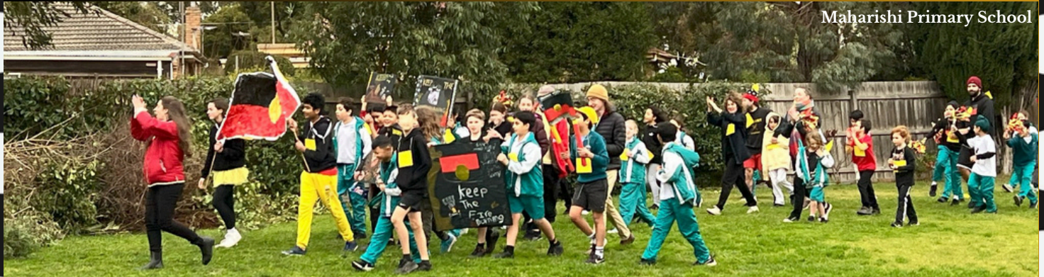
Maharishi Primary School

In the lead up to Aboriginal and Torres Strait Islander Children's Day on the 4th of August, 15 schools held events to raise funds for OTDF's Together We Walk campaign. We thank all staff, students and school communities who participated with over $15,000 raised in total. Schools have been actively fundraising for us throughout the year, and particularly during Reconciliation Week and NAIDOC Week. Their dedication and support have made a significant impact!