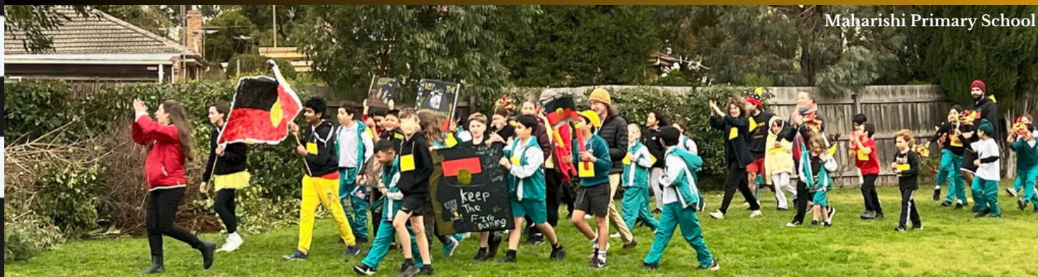
Maharishi Primary School

In the lead up to Aboriginal and Torres Strait Islander Children's Day on the 4th of August, 15 schools held events to raise funds for OTDF's Together We Walk campaign. We thank all staff, students and school communities who participated with over $15,000 raised in total. Schools have been actively fundraising for us throughout the year, and particularly during Reconciliation Week and NAIDOC Week. Their dedication and support have made a significant impact!