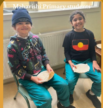
Maharishi Primary students