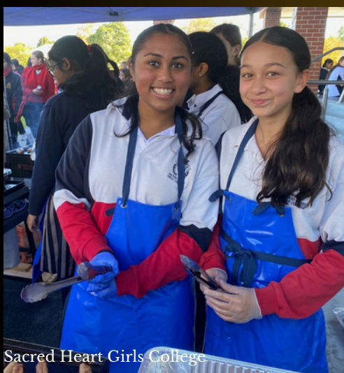
Sacred Heart Girls College