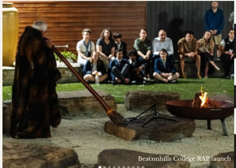
Beaconhills College RAP launch

A key responsibility of FIRE Carrier Schools is to raise awareness and fundraise for the Opening the Doors Foundation (OTDF)—supporting the educational aspirations of First Nations students. This commitment not only helps fund education grant but also affirms each school's dedication to fostering self-determination and cultural respect for First Nations families, both within their own communities and beyond.