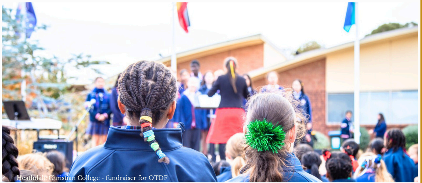
Heathdale Christian College - fundraiser for OTDF

OPENING THE DOORS FOUNDATION Keeping Koorie Kids in an Education of their Choice