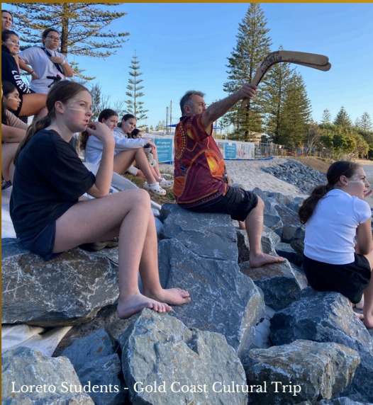
Loreto Students - Gold Coast Cultural Trip

The students visited the Jellurgal Aboriginal Cultural Centre at Burleigh Heads, a sacred place for the Yugambah people. There, they were guided along the Dreaming Mountain, visited natural ochre sites, and took part in a traditional ochre ceremony, learning how this sacred resource is used in art, dance, and storytelling. Throughout the camp, students engaged in cultural activities including weaving with Aboriginal women, participating in traditional dances and songs, and listening to Dreamtime stories passed down through generations. They also learned about bush tucker—native foods and medicines—and how these have sustained communities for thousands of years.